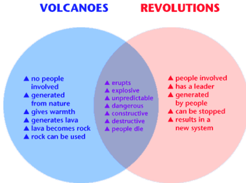
Fig. 5 - Venn diagram of volcanoes and revolutions