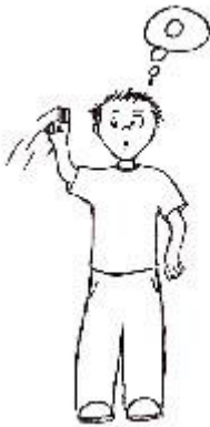
Fig. 7 - Student writing letter o in air while visualizing the shape of the letter and saying the name of the letter*

Practicing letter form or spelling words is enhanced by using air writing, another technique to create a motor image for the student (Richards, 1999, p. 163). Air writing (figure 7) involves writing the letters in the air (creating a motor image) while also imagining seeing the letters (creating a visual image). The student should simultaneously say the letter as she writes it in the air (creating an auditory image).