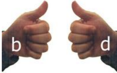
Fig. 6 - Hands forming the shape of the letters b and d - a motor image

Practicing letter form or spelling words is enhanced by using air writing, another technique to create a motor image for the student (Richards, 1999, p. 163). Air writing (figure 7) involves writing the letters in the air (creating a motor image) while also imagining seeing the letters (creating a visual image). The student should simultaneously say the letter as she writes it in the air (creating an auditory image).