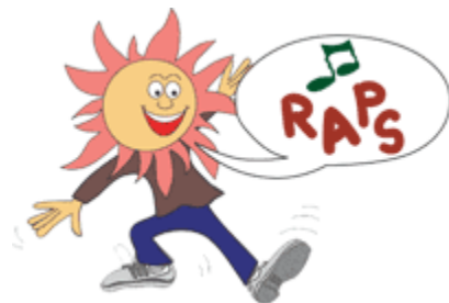
Fig. 3 - A mnemonic for the 4 freedoms granted by the First Amendment

A visual picture can cue a strategy or represent a concept. For example, suppose your student needs to remember that our First Amendment rights are free speech, religion, the press, and the right of assembly. Since it is the First Amendment and one rhymes with sun , use a sun as a visual cue. Draw a happy sun with legs and arms, singing. Place the word RAPS in a talk bubble, as shown in figure 3. RAPS is a mnemonic to remember the freedoms of R eligion, A ssembly, P ress, and S peech. (Richards, 2003, p. 198).