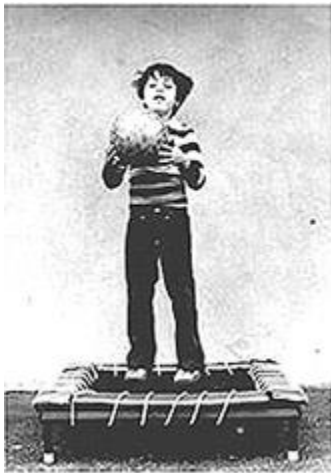
Fig. 2 - Novelty and multi-sensory learning

In figure 2, a child is jumping on a small trampoline, reviewing associations. He is also tossing the ball with each item.